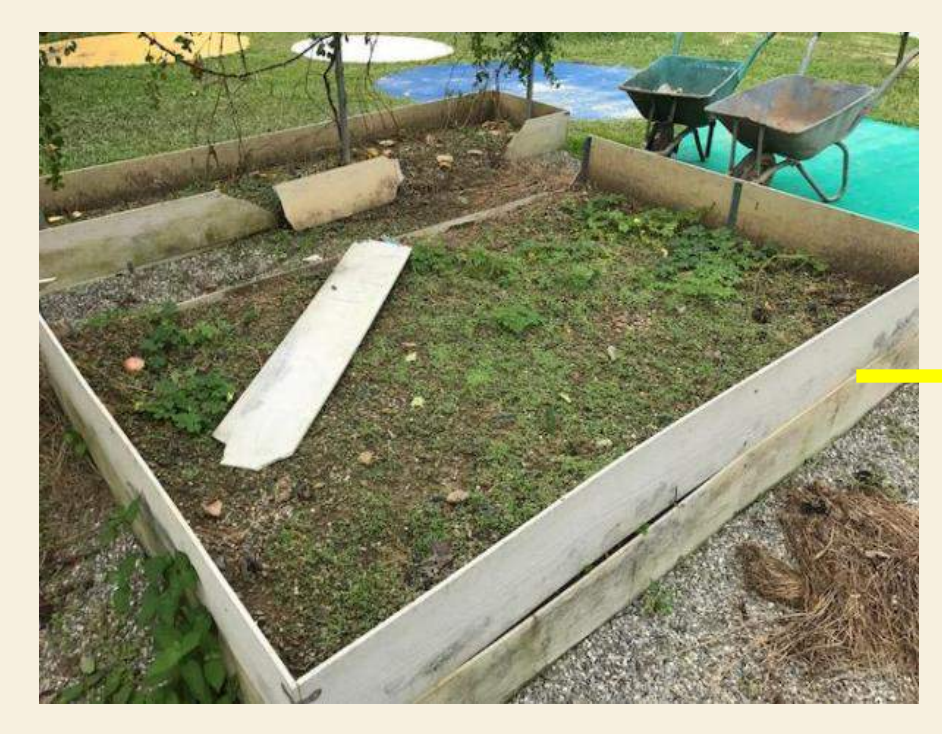
Soil without any plants