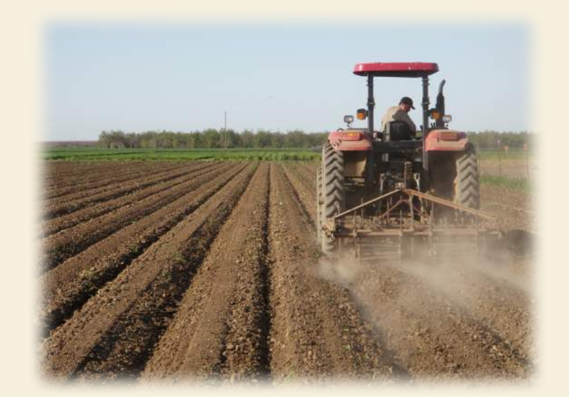
Large Machines to cultivate farms the size of hundreds of acres.