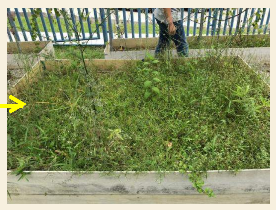
Weeds growing by itself if the soil is left unattended for a few weeks or months!