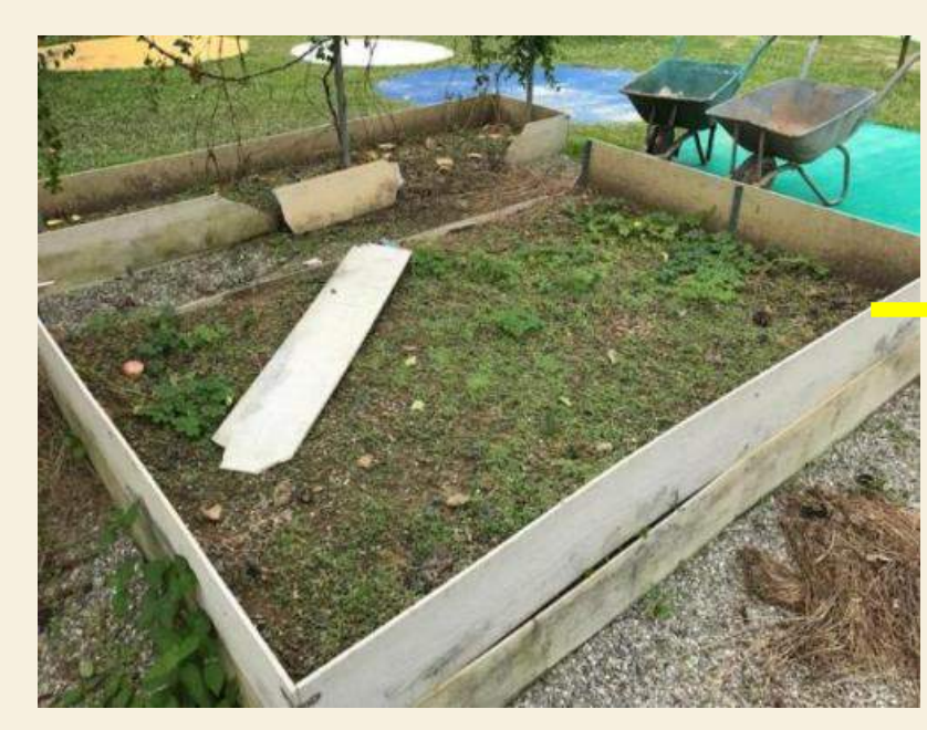
Soil without any plants