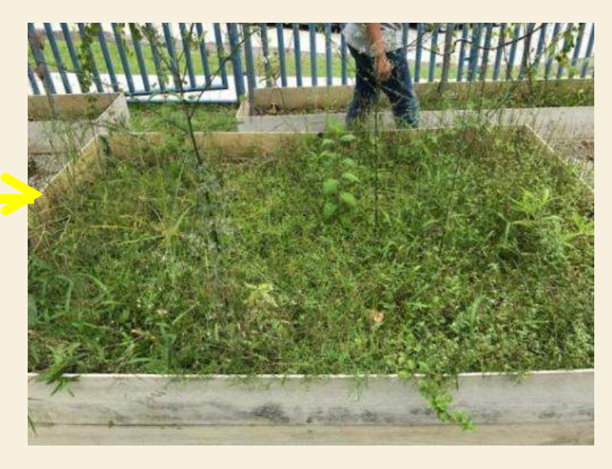
Weeds growing by itself if the soil is left unattended for a few weeks or months!